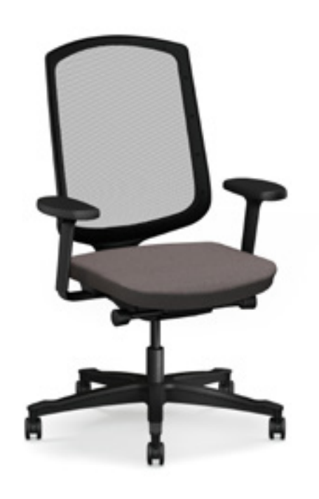
Mesh back 55 cm. Lumbar support, headrest and different armrests optional.