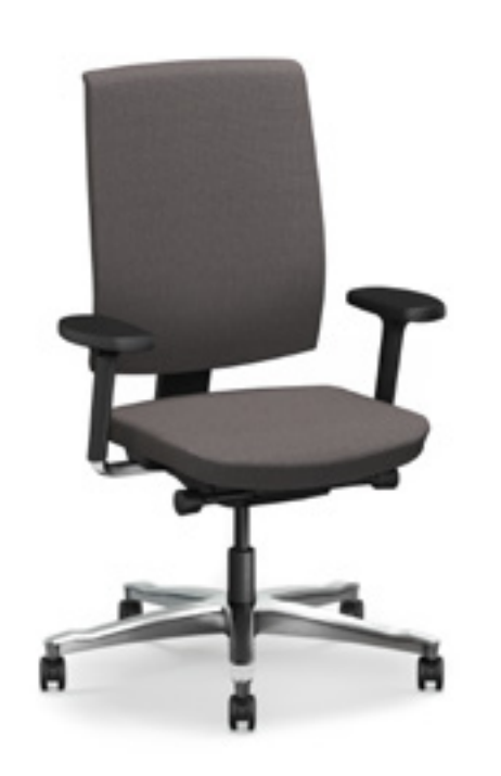
Fabric back 50 cm, available with two different backs, plastic and fabric covered. Headrest and different armrests optional.