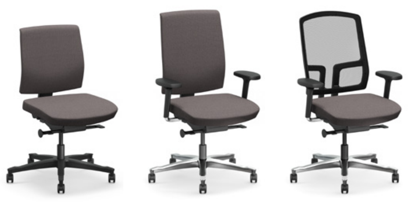
Fabric back 41 cm, available with two different backs, plastic and fabric covered. Different armrests optional.

Seat and back follow each other in a 2,7:1 synchro relationship with individual comfort adjustment of tilt resistance in the back. Sliding seat for easy seat depth regulation. The mechanism can be locked in four positions and the seat height is easily adjustable. The seat may be tilted forward.