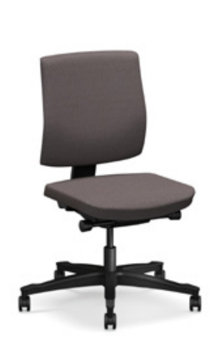
Fabric back 41 cm, available with two different backs, plastic and fabric covered. Different armrests optional.

Seat and back follow each other in a 4:1 relationship with automatic comfort adjustment of tilt resistance in the back. The backrest can be locked in an upright position and is adjustable in height.