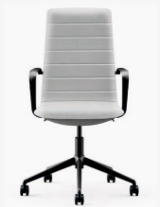
FAVOR 40 FAVOR 41 FAVOR 42