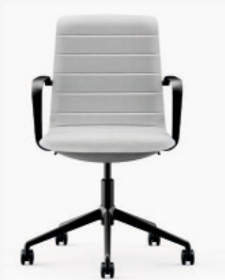
FAVOR 20 FAVOR 21 FAVOR 22