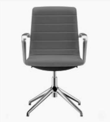
FAVOR 10 FAVOR 11