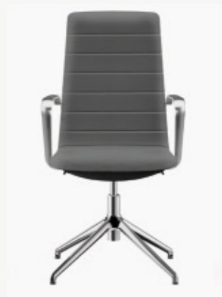
FAVOR 30 FAVOR 31